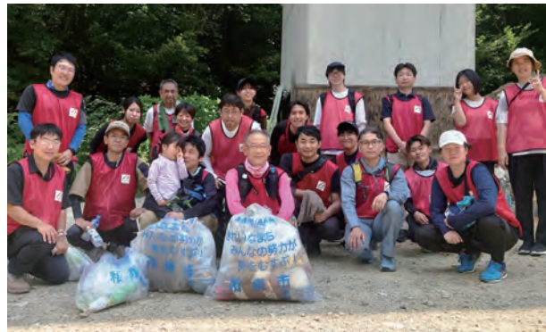
Around Osaka R&D Center