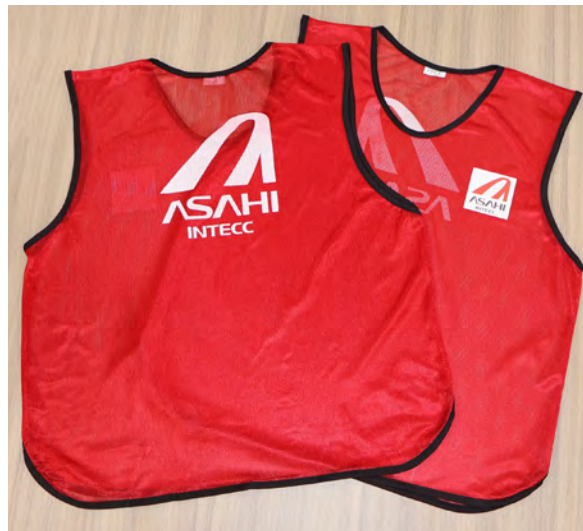
Original bibs with Asahi Intecc logo

As part of its environmental protection activities, our group is actively promoting employee-led volunteer cleanup activities. Volunteer clean-up activities were carried out at many sites in our group this term, too. We created original bibs with the Asahi Intecc logo on them, and by utilizing these bibs, our activities are showing further expansion. We will continue to actively carry out environmental protection activities rooted in local communities.