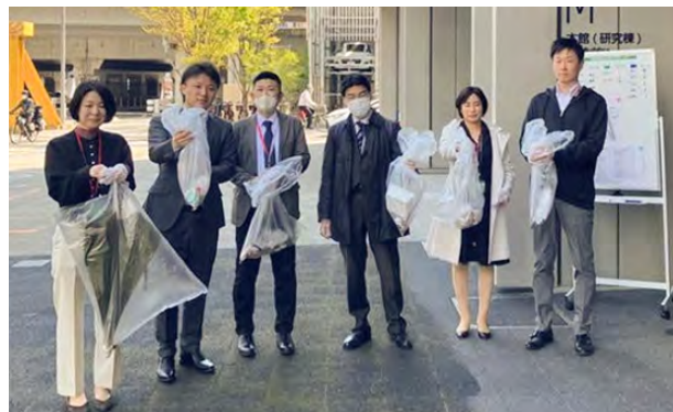
Around Nagoya Office