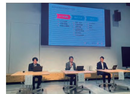
Giving a lecture