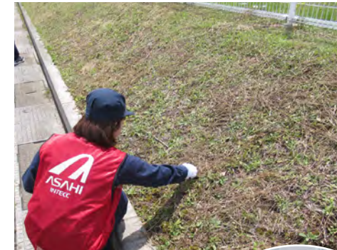
Around Tohoku R&D Center