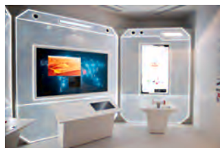
Asahi Intecc Future Medical Care booth