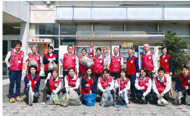
Around the Global Headquarters and R&D Center