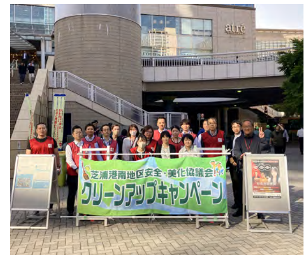
Around Shinagawa Office