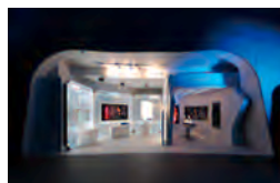
Developed in conjunction with the Flying Operating Room