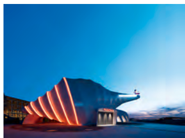
PASONA NATUREVERSE

In order to convey the pavilion's theme "Thank You, Life" at the exhibition, we introduced in an easy-to-understand manner the medical device technology and the role of catheter treatment that our company has cultivated. Remote surgery which symbolizes future medical care and next-generation medical concepts were presented, allowing visitors to experience the value and future potential that our technology provides to the medical field. Exhibiting at the Expo was an opportunity to widely disseminate our philosophy of "delivering better medical care to the world" to society. The dialogue and feedback we received from visitors gave us valuable insights that will be used in our future business activities and value creation.