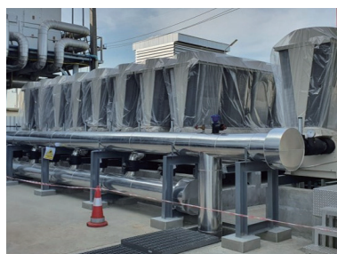
Installation of energy-saving chillers