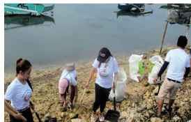
Seashore cleanup activities (Cebu Factory)

As part of its efforts to reduce the environmental burden, our company is actively participating in environmental protection activities closely linked to the area, including seashore cleanup activities and mangrove planting activities at Cebu Factory; and marigold planting activities and cleanup activities by Asahi Intecc Loveledge Nagoya around their home ground in Seto City where Global Headquarters and R&D Center is located. We will continue to carry out environmental protection activities rooted in local communities.