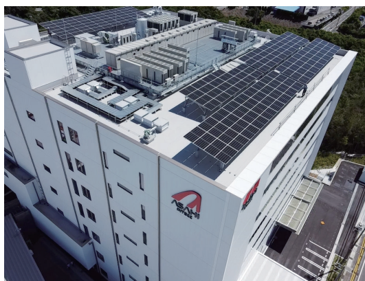
Installing solar panels at the new building of the Global Headquarters and R&D Center ANNEX Building

Our group is promoting the introduction of energy-saving boilers and the use of green procurement office supplies at its production factories, installing solar panels at its production factories, and planning to install solar panels at the new building of the Global Headquarters and R&D Center ANNEX Building. In addition, we are replacing existing equipment and introducing new equipment in consideration of energy consumption and energy optimization.