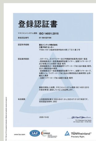
Osaka R&D Center, Asahi Intecc Co., Ltd.