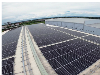
Installation of solar panels at Cebu Factory