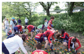
Marigold planting activities by Asahi Intecc Loveledge Nagoya and cleanup activities around their home ground (Global Headquarters and R&amp;D Center)