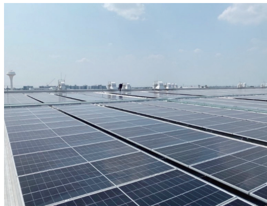
Installation of solar panels at Thailand Factory