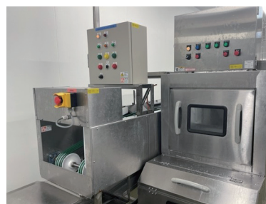
Water-saving dishwashers installed at cafeteria