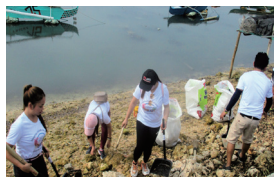
Seashore cleanup activities (Cebu Factory)