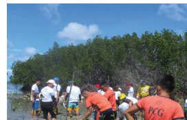
Activities for planting mangroves (Cebu Factory)