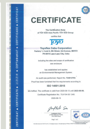
TOYOFLEX CEBU CORPORATION