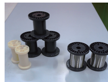
Promoting returnable bobbins and their reuse