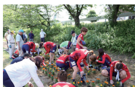
Marigold planting activities by Asahi Intecc Loveledge Nagoya and cleanup activities around their home ground (Global Headquarters and R&D Center)