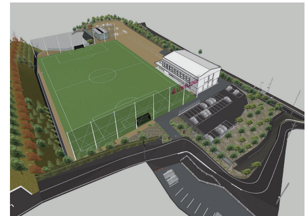
Completed image of the ground

This facility will be used as a training base for Asahi Intecc Loveledge Nagoya and welfare facility for our employees, and also rented out to local residents to promote sports in the region. We also plan to use this facility as a base for various community contribution activities through sports, in cooperation with Seto City.