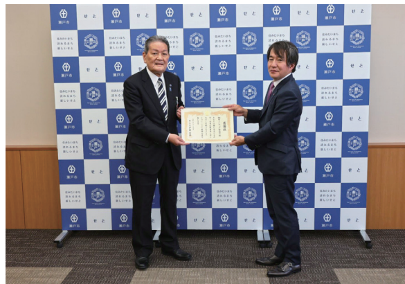
The photo shows the presentation ceremony in November 2021.

The donation will be used to purchase daily necessities such as disposable diapers and food for families with child-rearing difficulties, to pay for transportation and custody of children, and to support young people's continued learning. We will continue to support this initiative of Seto City.