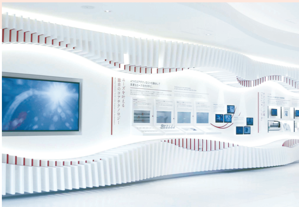
Global Headquarters and R&D Center