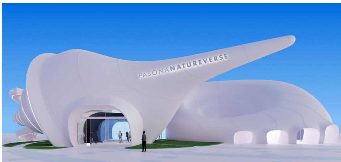
▲ "PASONA NATUREVERSE" exterior concept image